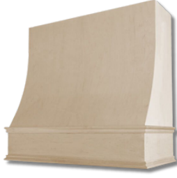
SLOPED CLASSIC TRIM