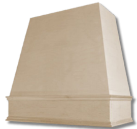
TAPERED CLASSIC TRIM