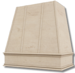
TAPERED WITH STRAPPING FLAT TRIM