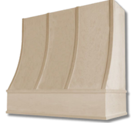
SLOPED WITH STRAPPING FLAT TRIM