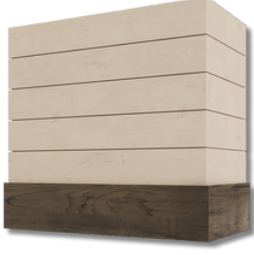
BOX WITH SHIPLAP WALNUT BAND