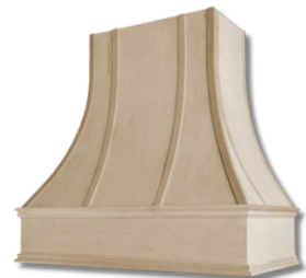
CURVED STRAPPING FLAT TRIM