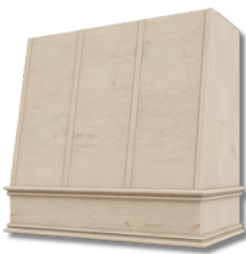
ANGLED WITH STRAPPING FLAT TRIM