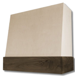
ANGLED WITH WALNUT BAND