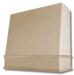
ANGLED CLASSIC TRIM