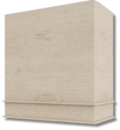
BOX BLOCK TRIM