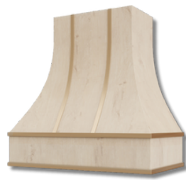
CURVED WITH BRASS STRAPPING