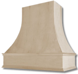
CURVED CLASSIC TRIM