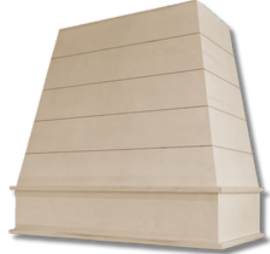
TAPERED WITH SHIPLAP BLOCK TRIM