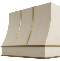
SLOPED WITH BRASS STRAPPING FLAT TRIM